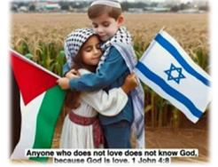
Anyone who does not love does not know God, because God is love. 1 John 4:8

Many of us are so blessed with peace in our beautiful country. We hear many a times what is happening in the world around us and wonder what next. We must thank God for the peace that we enjoy in this country and not forget to support others not privileged with such serenity. The awareness and offering our prayers and thoughts is so much appreciated. Every time we celebrate Mass, we do offer a sign of peace. Perhaps this part of the Mass passes so quickly such that we don't reflect on its meaning. The church included this prayer of peace in Mass because we know that it is the key to our existence. I think of the shattered future of families, especially the school children and the young among many others of all these regions that are currently in turmoil of war. Their lives have been changed into uncertainty but we must not give up. However far we are, let us do what we can in small or big ways as good Catholics.