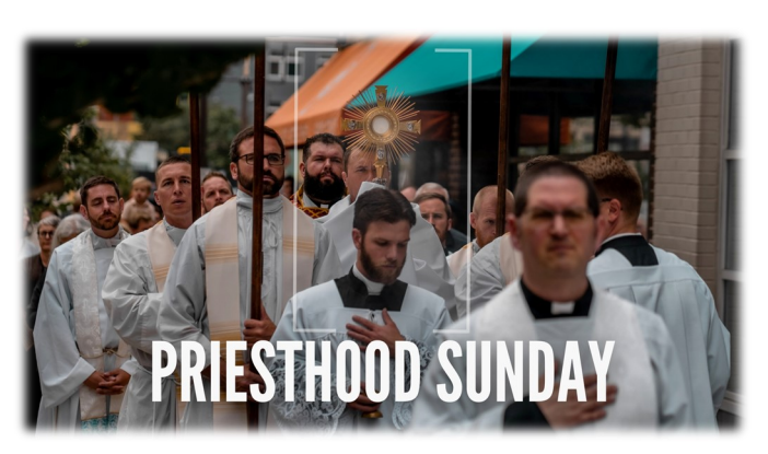
Today, Sept. 29th, is Priesthood Sunday Take time to Thank a Priest for following his calling to serve Jesus