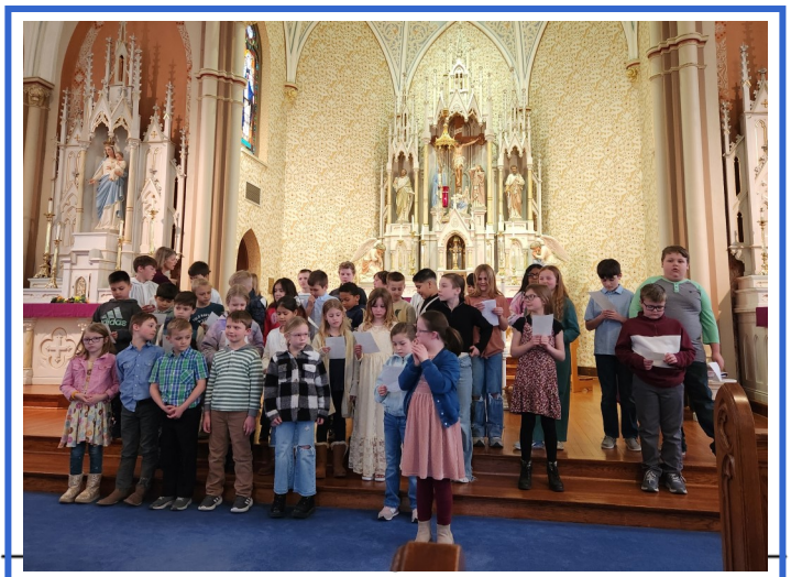
Youth Mass—2025 So proud of this group of students!!! They did an amazing job.