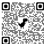
St. Joseph Wisner