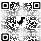
Holy Cross Beemer

Online Giving with Tithe.ly Both St. Joseph and Holy Cross parishes have an online giving option. For additional ways to contribute, QR codes have been made for both parishes, or you may still sign up under the parish websites. If you have any questions, call the parish office at 402-529-3891.