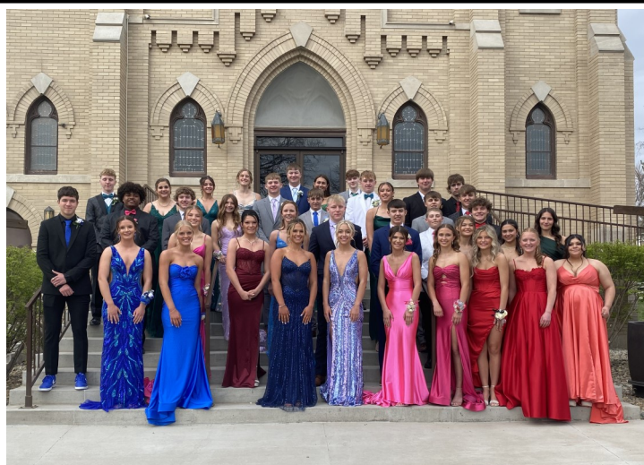
Prom Mass was celebrated on April 27th, by Wisner-Pilger Jrs. & Srs. and their dates. A beautiful way to start their special evening.