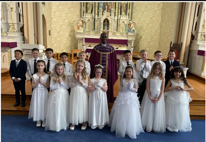
CONGRATULATIONS to our First Communicants!! They received the body and blood of Christ for the first time on Sunday, April 6th. May the peace and love of Christ fill their hearts always.