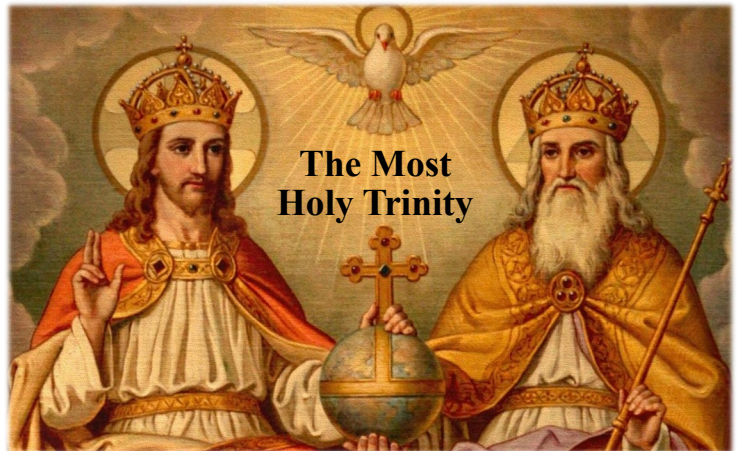
The Most Holy Trinity

A CORPUS CHRISTI PROCESSION will be held at St Boniface next Sunday, June 7 beginning with Mass that fulfills the Sunday obligation at 2pm. The practice of having a Corpus Christi (Body of Christ) Procession dates back to the 13th century. In 1891, St Boniface parishioners looked back to their Old World tradition for a feast through which they could thank God for the blessings they had received. The feast they chose was called "Fronleichnamfest" or Corpus Christi. This tradition at St Boniface continued every year up to about 6 years ago. Today we also are thankful for the many blessings we have received and want to honor our Lord in the same fashion. The Mass and Procession is open to everyone and I hope to see members from all parishes in our family celebrate this feast together.